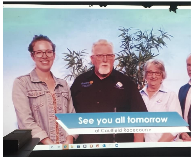
Presenters on the Zoom screen