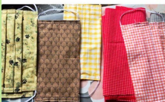
750 masks for The Alfred Hosp for allied Health Workers