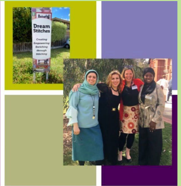
Dream Stitches A Migrant and Refugee women's sewing program